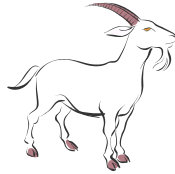
For the Lord